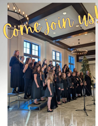
newnan community youth choir

REHEARSALS BEGIN SUNDAY, JANUARY 25 4:00PM-5:15PM